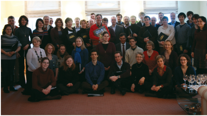
Chorus Members at the Ambassador's Residence in Tallinn, Dec 2010