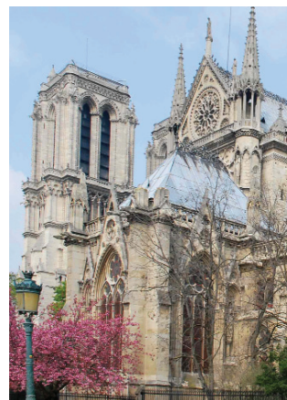
Notre Dame, Paris