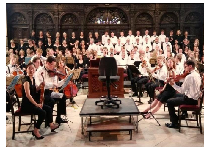
CU Symphony Chorus with CUMS Symphony Orchestra, King's, June 2017